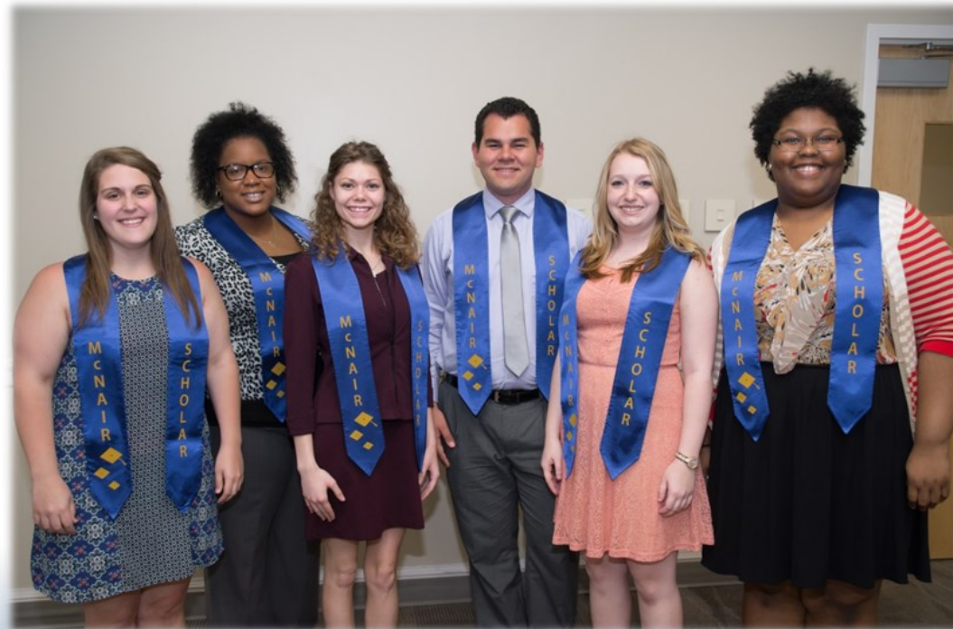
May and August 2016 Graduates